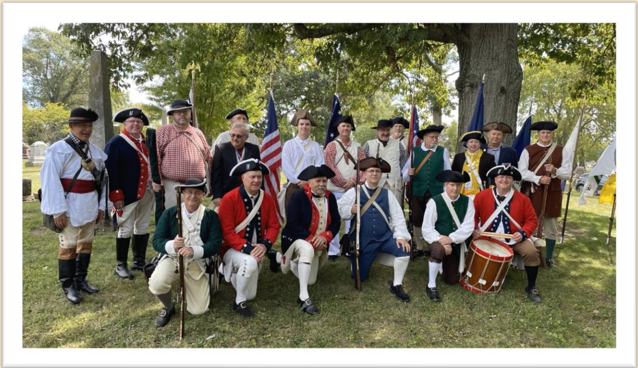
Patriot Grave Marking (Camp Charlotte Chapter)- Circleville, Ohio September 2023