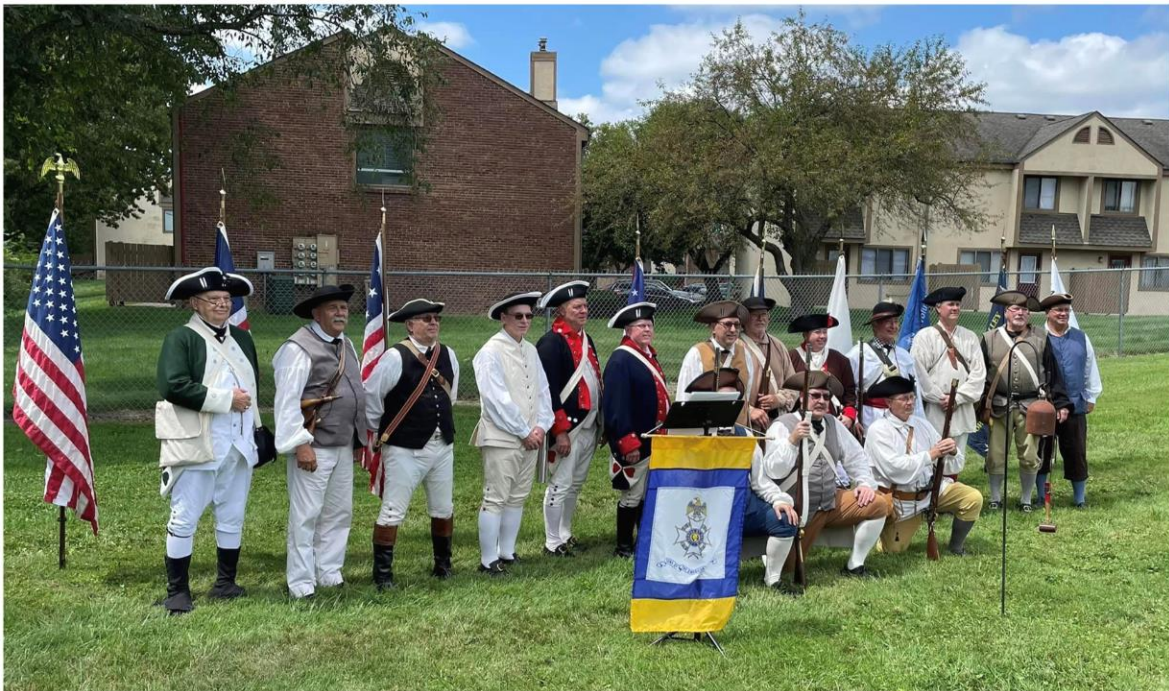
Patriot Grave Marking (Benjamin Franklin Chapter)- Reynoldsburg, Ohio August 2023