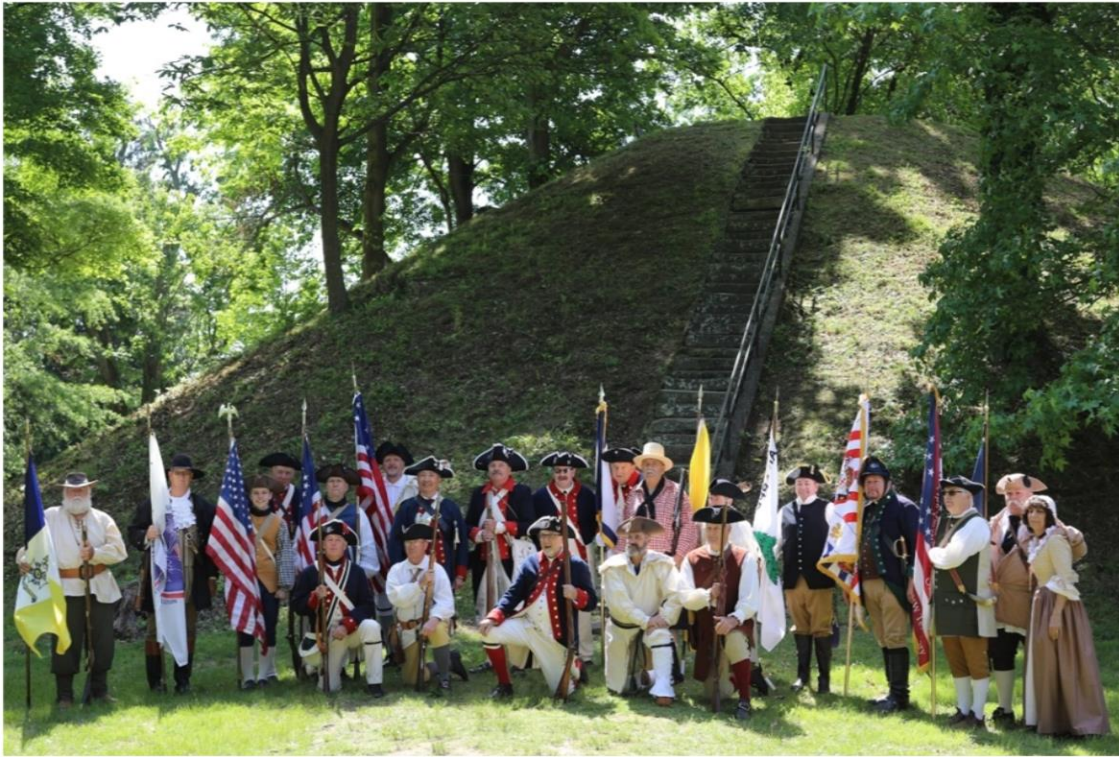
Revolutionary War Patriots Memorial Service – Mound Cemetery May 25, 2023