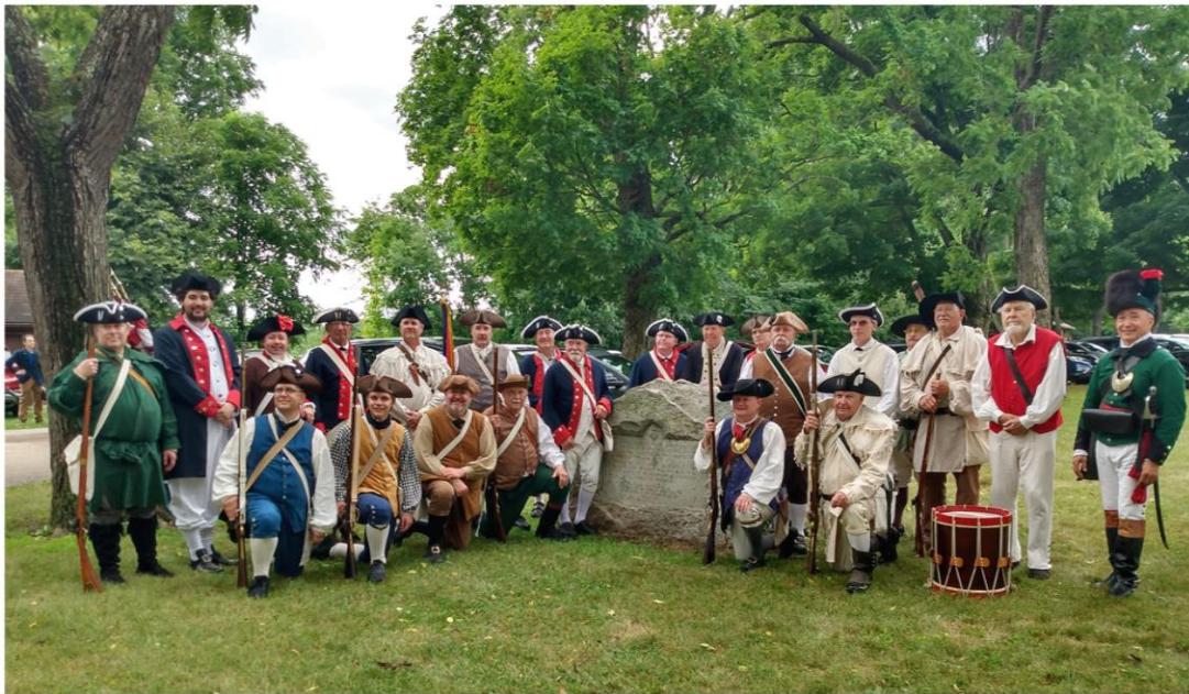
Ft. Laurens July 2023 – Bolivar, Ohio