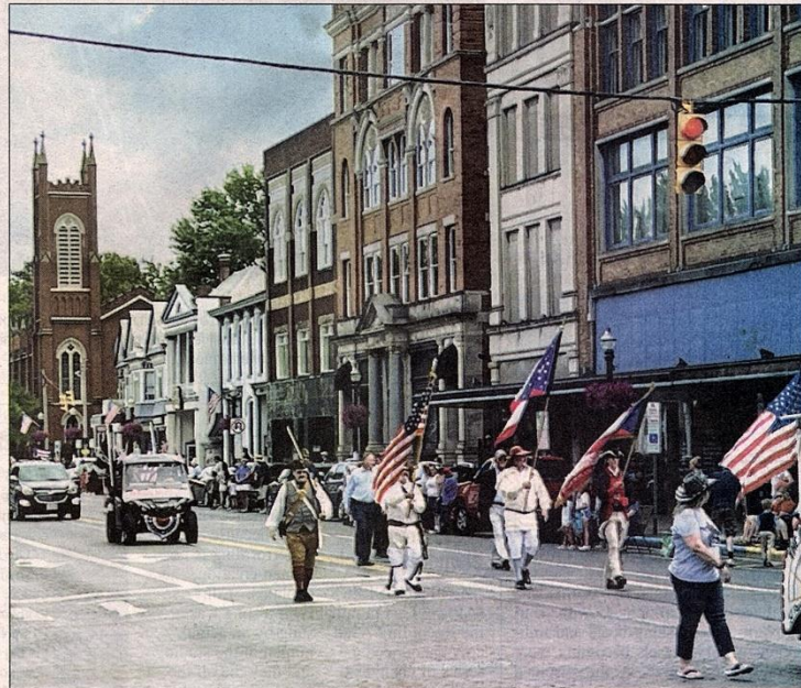
Members of the Sons of the American Revolution Marietta Chapter march in the annual Independence Day parade Tuesday in Marietta.

And while Democrats said they got some wins, overall they claimed the budget still doesn't do